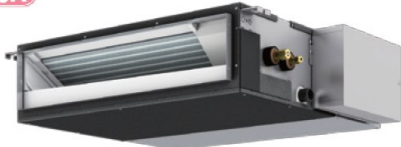
SEZ-M25/35/50/60/71DA3 (Requires Wired Remote Controller)